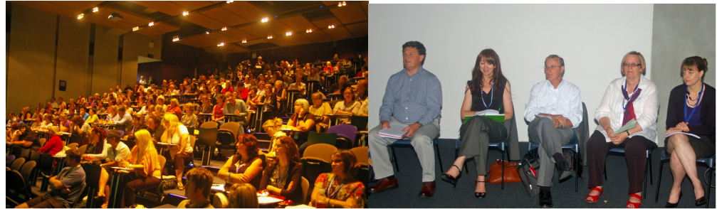
Some of those who gathered and some of the experts who had their say on how we can do it better

"It has been brilliant... Some of the best information I've come across in a long time at a conference"