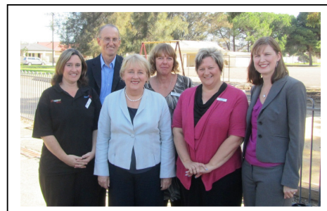
Minister Macklin and Parliamentary Secretary Collins with SA C4C managers at the launch